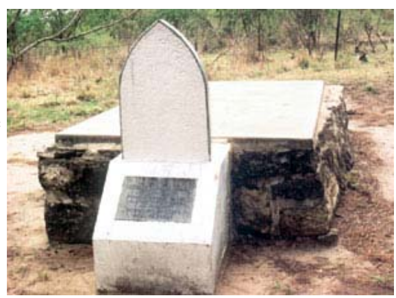
James Rorke's grave at Rorke's Drift

Early morning game drive. Battle of Kambula. The site has hardly changed since Col. Evelyn Wood's column broke the power of the Zulu army in March 1879. An icon battle set in panoramic terrain. Overnight at Villa Prince Imperial, Vryheid or Strathcona Lodge.