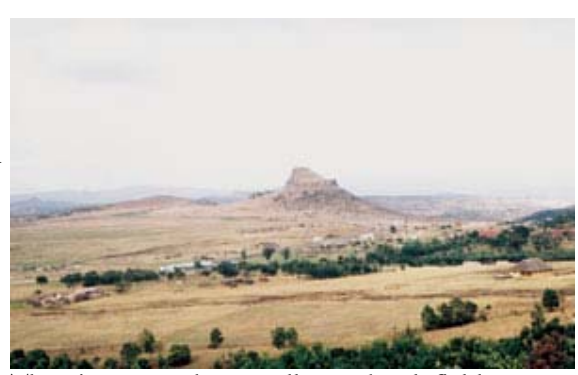
The view over the Isandlwana battlefield

Site of the Battle of Isandhlwana, Mandani Falls. Follow the route of Lord Chelmsford's column on the day of the battle, into Magogo Hills and his breakfast picnic site. Visit iTusi where Raw and Roberts encountered the Zulu army. View the Mgwebeni Valley, the site of the Zulu bivouac. Overnight at Isibindi Lodge (game reserve).