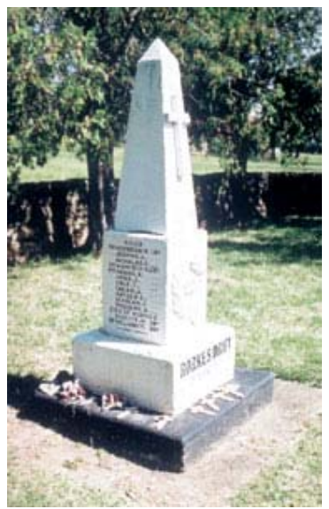
Memorial at Rorke's Drift

Either spend the day at Umhlanga Rocks on the beach etc, or enjoy a trip to Durban and visit the old fort (siege of 1842), Warrior's Gate Military Museum and have lunch overlooking the harbour. Late afternoon, board transport to Durban airport for flight to Johannesburg with overnight flight to London Heathrow.