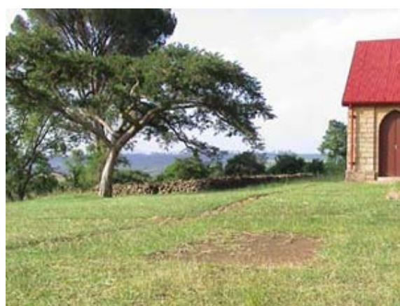
The cattle kraal