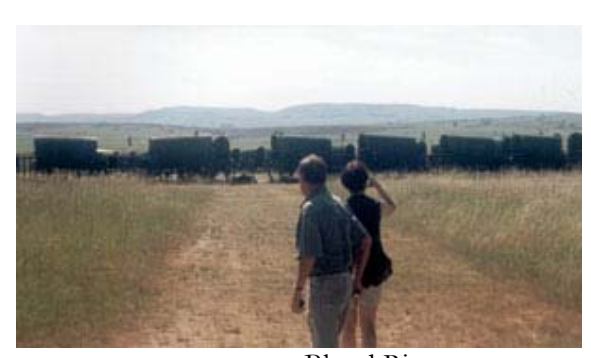
Blood River monument

Another chance to visit Isandhlwana. Walk the Fugitives' Trail part way. Afternoon visit to Melvill and Coghill's grave above the Buffalo River and walk down to the Fugitives' Drift. Afternoon, the battle of Rorke's Drift. Overnight stay at Isibindi Lodge.