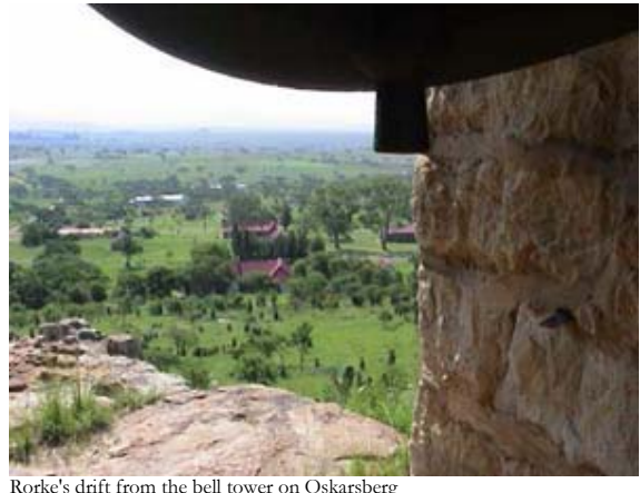
Rorke's drift from the bell tower on Oskarsberg