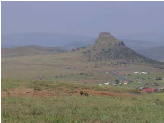
Isandhlwana, from the hill the Zulu's attacked from