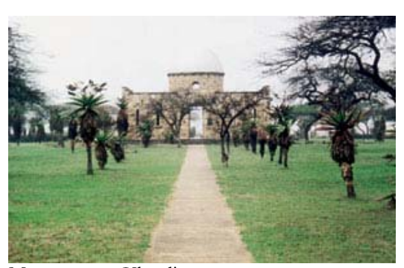
Monument at Ulundi