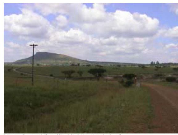
The road to Rorke's Drift, with Oskarsberg in the distance