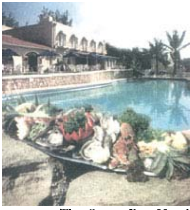
The Oyster Box Hotel

You will be met on arrival at Durban Airport and transported to Umhlanga Rocks. Overnight stay at the Oyster Box Hotel, which overlooks the Indian Ocean at Umhlanga Rocks.