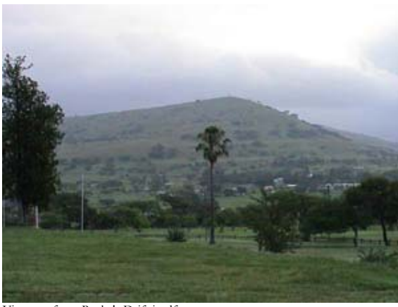
View out from Rorke's Drift itself