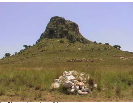
Isandhlwana and one of many Cairns