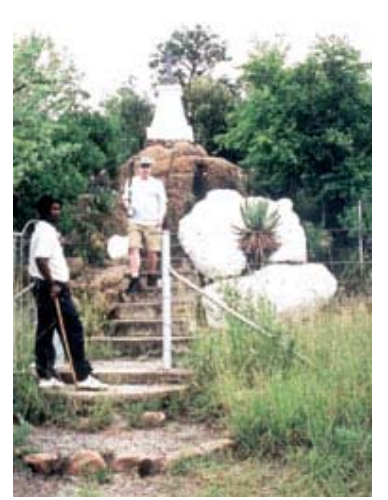
Monument and graves of Melvill and Coghill