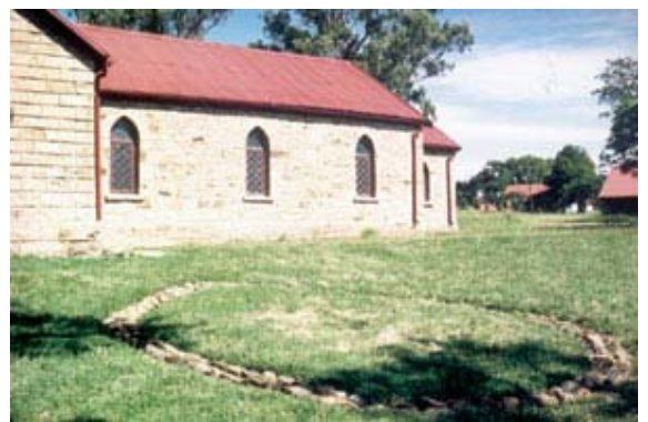
Site of final redoubt and present day church at Rorke's Drift