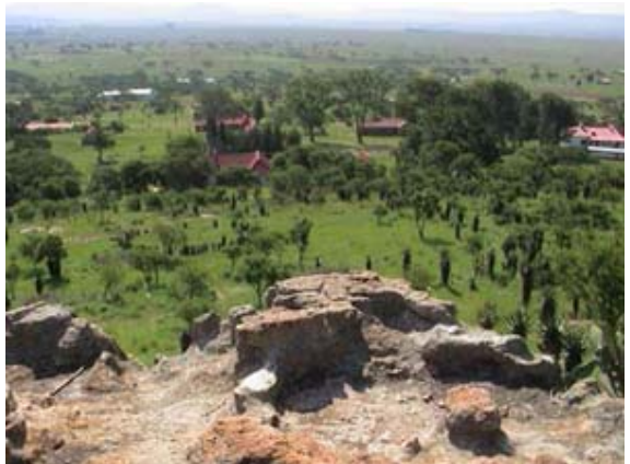
The view from the bell on Oskarsberg towards Rorke's Drift